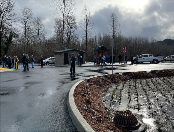
Constructed with funding from the Oregon Dept. of Fish & Wildlife, Oregon State Marine Board, Clatsop County Parks Dept., U.S. Fish and Wildlife Service, the Columbia River Yachting Association and Georgia Pacific Corp., the new docks are a great example of what can be achieved when multiple agencies and the private sector work together towards a common goal.