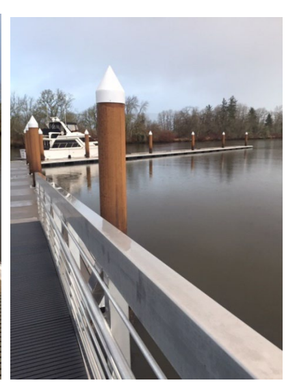
Paddelers will find a dock just for non motorized craft which features an inovative ADA compliant "cradle-type" launching platform.